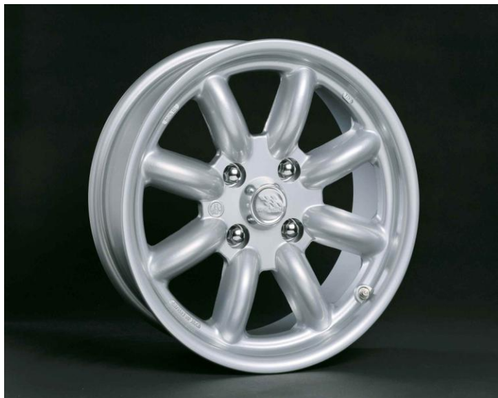
15x7 Compermotive Minilite or CXR or CXG wheels

Some of the parts found in the kit as standard