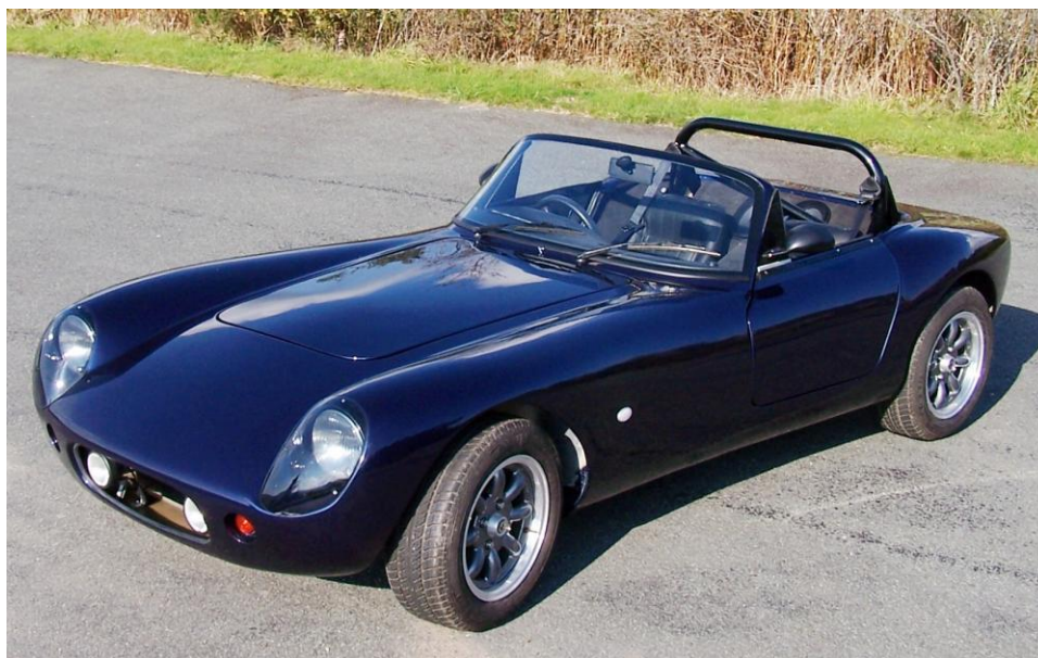
This is the live axle Stylus.

Much more classic looking than the more aggressive RT. Both have identical chassis and front suspension. The difference between the Stylus & RT is the Stylus is live axle rear end, and the RT has independent rear suspension, as well as having a slightly wider track.