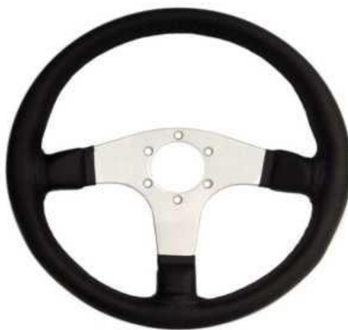
Mountney M range leather Steering wheel