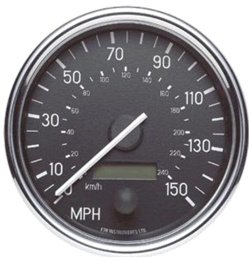
ETB 80mm electronic speedo chrome bezel, white on black Other colour combinations available.