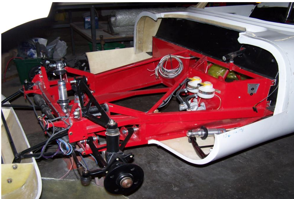
LHD Stylus flip front under construction.