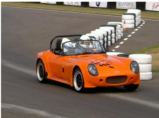
Testing a new anti roll bar at Goodwood. It produced 90sec lap with a passenger. (More yet to come)

Chassis, with raised pick up points, Adjustable pedalbox and balance bar, Lightweight inner tub, Lightweight body shell, Lightweight loom, All suspension components, (dampers not inc) (rose joint compatible non std) Modified Mk2 Escort axle, (Stylus only) Modified Mk2 escort front uprights, Lightweight steering column and shaft, Alloy panels and rivets, Light kit, 3-piece dash, MSA spec roll bar, Radiator, Sicaflex, (The Motorsport spec kit is not suitable as a road car)